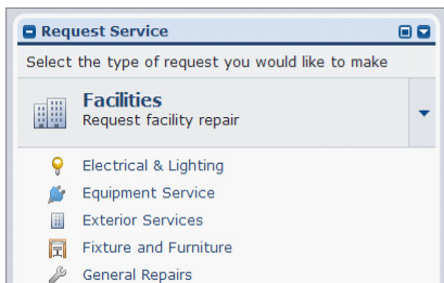
TRIRIGA Request Central streamlines product and service requests

In today's fast-changing business environment, the workplace is evolving and is being redefined as a more dynamic, mobile environment. To keep up with these changes, organizations like yours are looking for new ways to apply technology to their processes, giving them new tools to control costs, meet requirements and make instantaneous, yet accurate decisions.